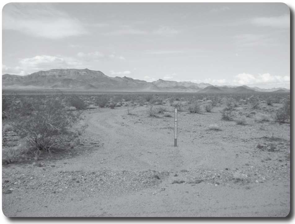
Figure 1—Before CDD wilderness restoration of a vehicle way.

dead plant material) and horizontal mulching (placing dead plant material on the ground) helped promote re-vegetation. These techniques helped capture wind blown seeds and more effectively retained moisture. These restoration efforts reduced the visual impacts of vehicle ways and effectively prevented illegal vehicle access into Wilderness areas.