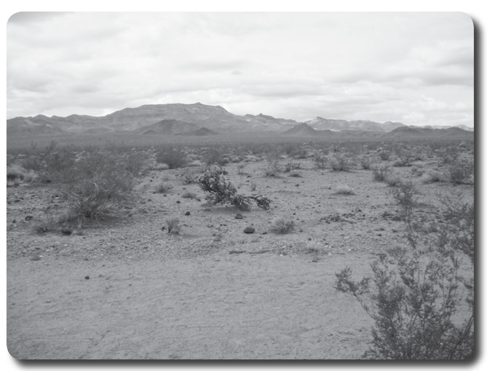
Figure 2—After CDD wilderness restoration of a vehicle way.