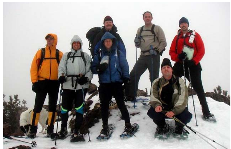
BARK atop Paulina Peak