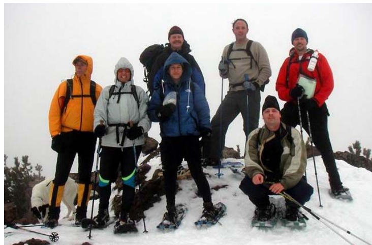
BARK atop Paulina Peak