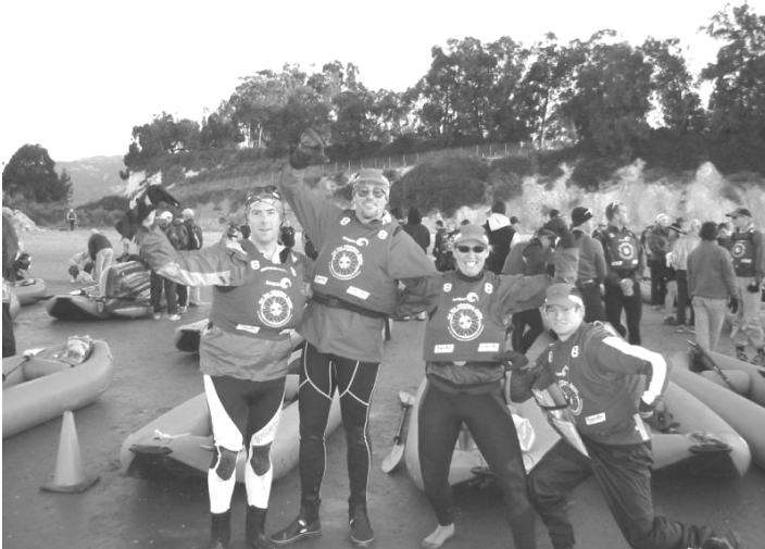
Team BARK/Lava Gear-- friends at the start and at the finish.